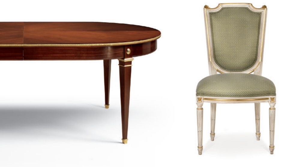
TABLE - CHAIR Art. 8616 Art. 8448

Art. 8616 - Table Louis XVI with brass profile built into the edge of the top. 2 central extensions with beam cm 60 each.