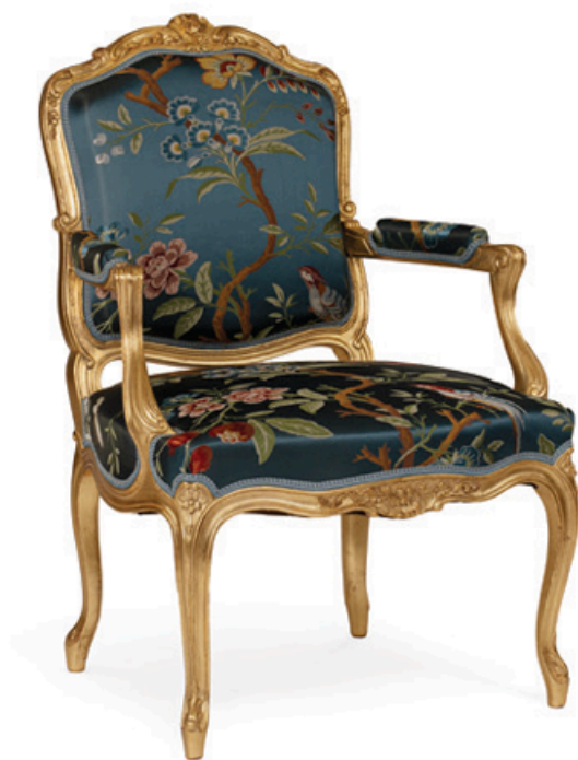
Art. B/03 PT - Armchair Louis XV with carvings, fixed upholstered.