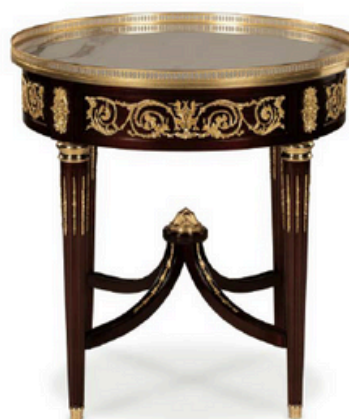
Art. 8795 - Small Table Louis XVI, marble top. Frame and details in brass.