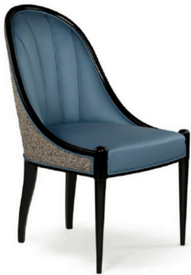
Art. 8698 - Chair upholstered.