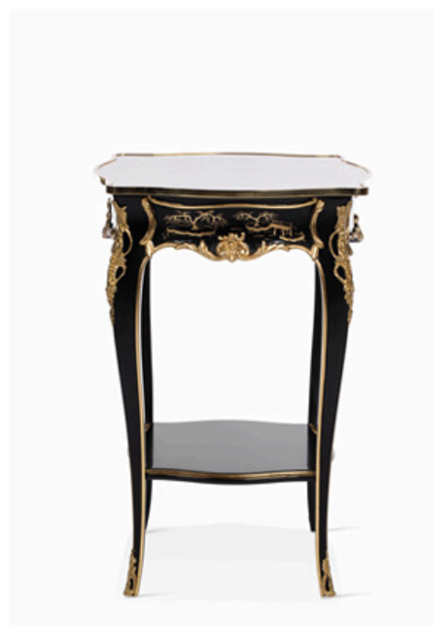
Art. 8733 - Small table Louis XV, marble top. Chinoiserie decorations on all sides, 1 side with drawer, 1 shelf. 5