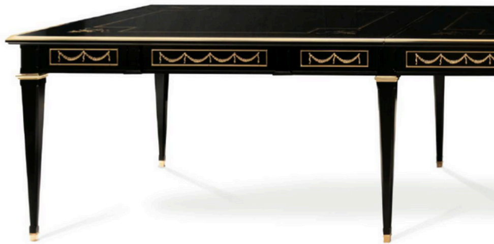
Art. 8789 - Table Louis XVI, glass top with golden leaf decorations.