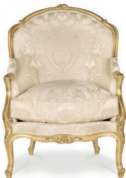
Art. 8794 - Bergère Louis XV, upholstered with seat cushion.